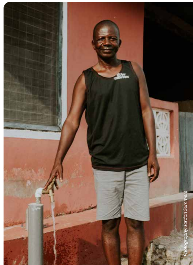
Photography: Jordan Summers